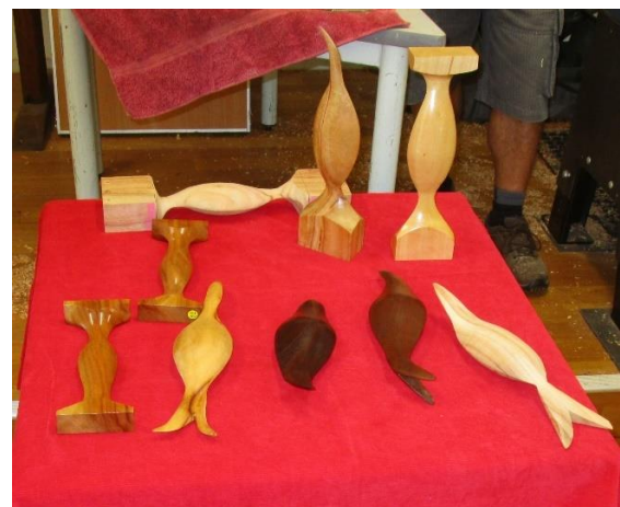
A Table Full of Project Ideas

The blanks were removed from the lathe and jig. Steve ran one of the items through a bandsaw to remove surplus material at the ends and refine its appearance. He put a number of past projects on the table shown below to demonstrate some of the designs he has been developing.