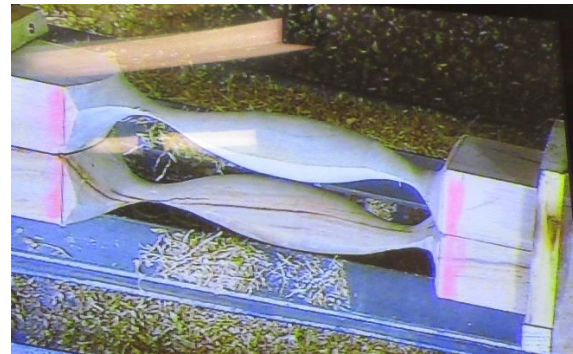
The Turned Items (Sorry about the fluro light)

The blanks were removed from the lathe and jig. Steve ran one of the items through a bandsaw to remove surplus material at the ends and refine its appearance. He put a number of past projects on the table shown below to demonstrate some of the designs he has been developing.