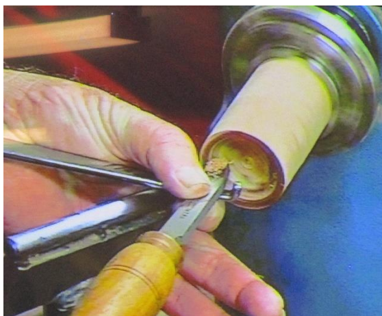
Ken Cutting the Internal Thread

Ken fitted the bottom section to the top section and refined the external surfaces.