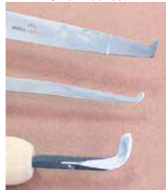
3 Recess Tool Examples