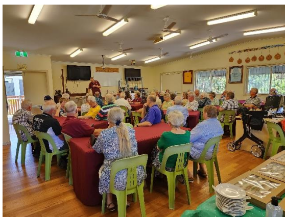
The Assembled Guests

On Friday 28 October, we hosted a morning tea for long time members to thank them for their past service to and hard work for the Society, and for them to see how the club has evolved over the years. Of course, it was a great opportunity for all to catch up with old mates and swap yarns.