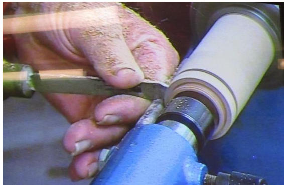
Pill Box Bottom Being Removed

application up to 6 times. Next, he removed waste from the inside of the blank to make a small pill box project. He used a parting tool to remove a small pill box size object bottom.