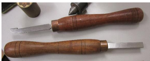
Ken's Matching Thread Chasers