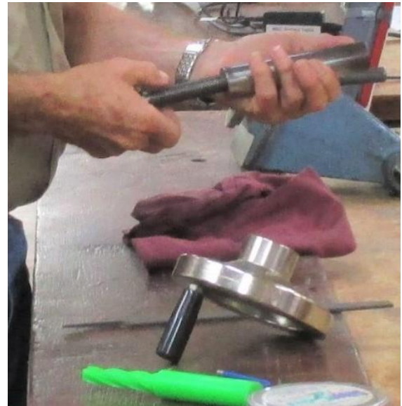
Reg Reassembles the Tailstock Components