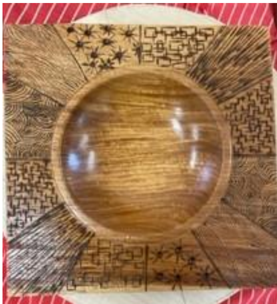
Embellishment by Peter Wyer

Some of you may not be particularly interested in producing pictures as such, but very interested in using pyrography to embellish, or even sign, your turning or other woodcrafts. These elements will also be covered in this course.