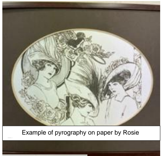
Example of pyrography on paper by Rosie