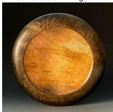
Ebonised Mango bowl