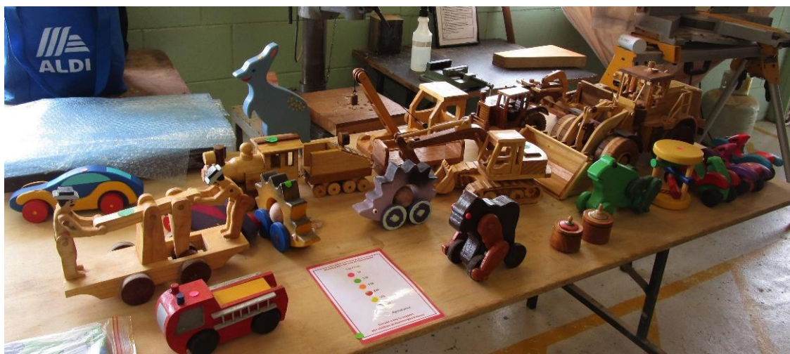
One of the Toy Group's Displays