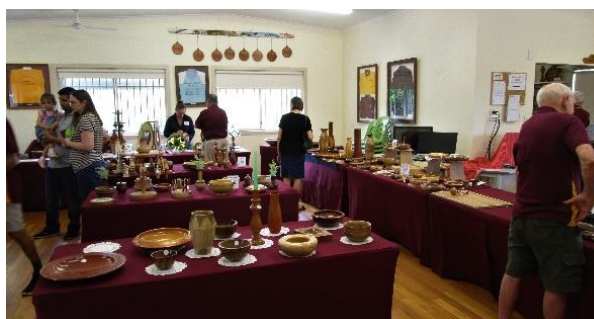
Sale Tables in the Auditorium