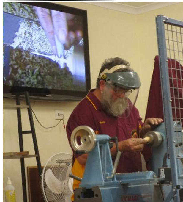
Sanding Finial 4