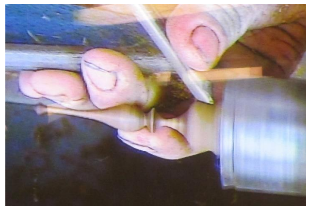
Finial 1 Being Turned