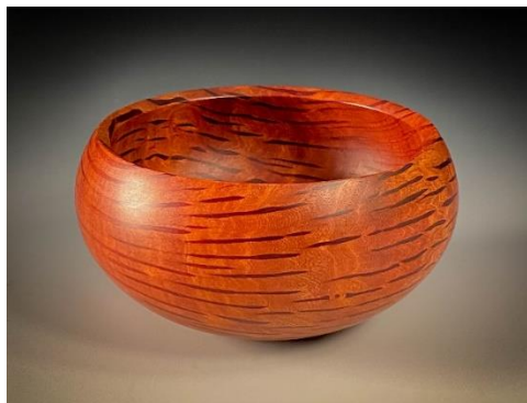
Flame She oak bowl