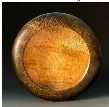
Ebonised Mango bowl