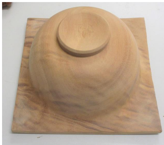
The Bowl at the End of the Demonstration