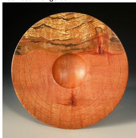
Spalted Tasmanian Myrtle bowl