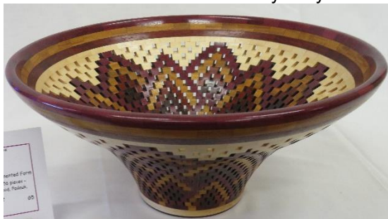
2019 - Allan Short – 'Field of Pansies'