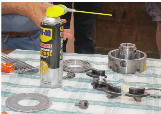
The VM120 Ready for Reassembly

All parts were placed into a degreaser bath to clean them. These were then rinsed and dried. Compressed air was used to dry and clean some parts. The parts were examined to see if there were any burrs on any edges which would indicate wear. These burrs would be removed using a file. This wasn't necessary with the VM120.