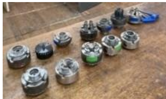
Some of WSQ's Chucks

At this point the session became very hands on with members taking the opportunity to do some maintenance, under supervision, on their own chucks, and on some of WSQ's numerous chucks