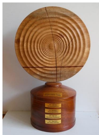
People's Choice Trophy 2021