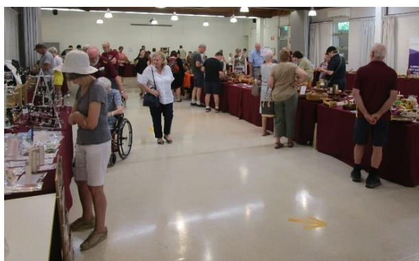
The Saturday Morning Crowd

First, let me start with some fantastic news. The Mt Coot-tha Exhibition held last weekend achieved our best ever result with sales of $19,100 which is some $5,000 better than the existing record. On top of this, the café and door raffle also generated $1,400 in revenue. Thank you to all the exhibitors and volunteers who contributed over the weekend, including those who stepped up at the last minute to cover some unplanned absences. Whilst not wishing to single anyone out, I think special thanks are due to those at the sales counter who were under a lot of pressure for much of the weekend to process and wrap the purchases and keep the queue to an acceptable length.