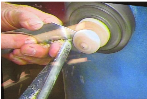
The Head Being Parted Off

Ian inserted a drive dog in the chuck and mounted the Tasmanian Oak blank on the lathe. The target diameter for the head is 35 mm. He rounded the blank with a roughing gouge. Next, he created a small spigot at the tailstock end and reversed the blank into the chuck. Using a skew chisel and a spindle gouge Ian created a small point about 3 mm above the surface. This was to become a nose with a bit more work. The next challenge was to create a sphere by eye without damaging the nose using a spindle gouge with light cuts and shear scraping. He used a parting tool to remove waste near the chuck and then shaped and refined the finish so the connection to the timber in the chuck was greatly reduced. Ian lightly sanded the blank and applied some finish. He used a 1 mm parting tool to cut the head from the blank.