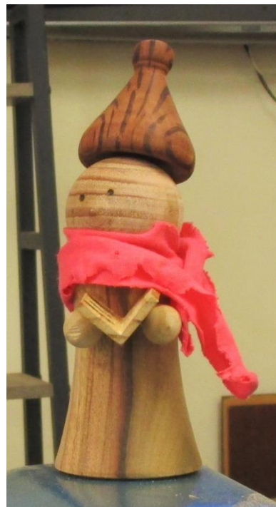
The Demo Piece with a Scarf to Keep it Warm