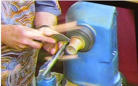
The Body Being Parted Off

the blank into. He shaped the blank such that the tail stock end had a smaller diameter than the other end. Ian used a parting tool to create a spigot just clear of the chuck jaws. Using a spindle gouge, he hollowed out a couple of mm of waste, leaving a collar which he rounded the edges of. Next, he sanded the blank and applied Triple E polish, except to the inside of the collar at the top. Ian used a parting tool to shape a bevel to the bottom edge. This creates a shadow line to the figure making it appear to be floating above the ground. He used a 1 mm parting tool to cut the figure from the waste in the chuck.