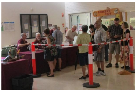
The Steady Flow of Customers at the Sales Counter

The final result for the weekend is yet to be determined as some expenses are still outstanding, but our finances will receive a welcome boost following the cancellation of the August exhibition.