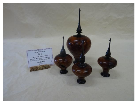
Red Mallee Lidded Containers by Ian Symes