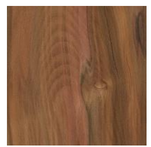
Red Mallee (sealed)

suited for lumber, though they do have a propensity for burl growths that can be harvested and used for turning and other small specialty projects.