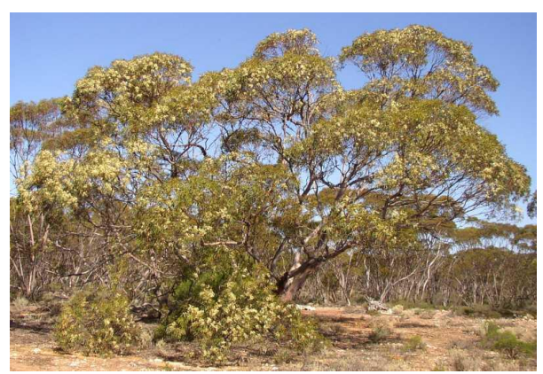
Red Mallee "Habit"