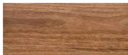
Spotted Gum Timber