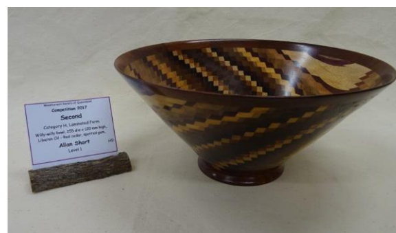
Laminated Bowl Using Spotted Gum by Allan Short