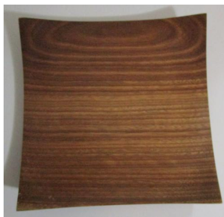
Spotted Gum Sushi Platter