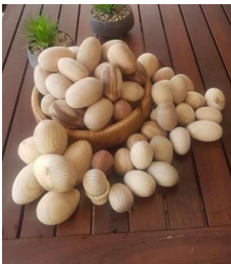
Here are the eggs

WSQ has invited students from Greenslopes State School to be part of our wooden egg competition. WSQ Members made and presented to the school 60 wooden eggs for the students to decorate.