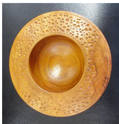
A Completed Project