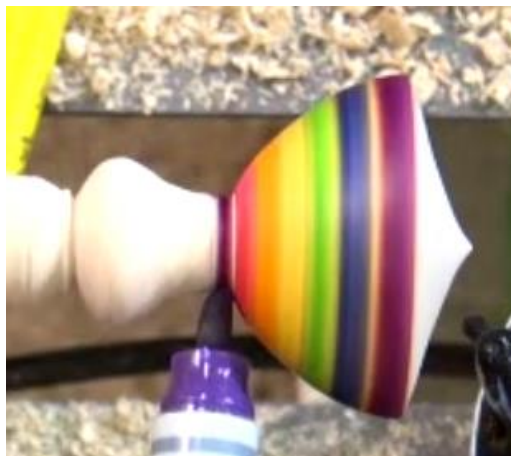
Figure 5 - Colours of the Rainbow