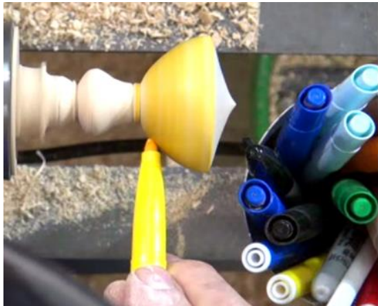
Figure 4 – Bic Visa Yellow Colour