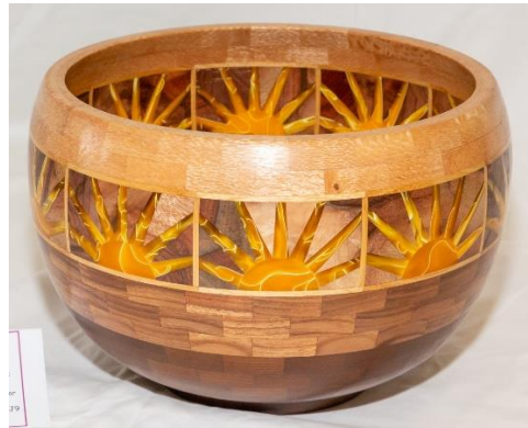
Allan Short's Competition Pieces Segmented with Acrylic Components