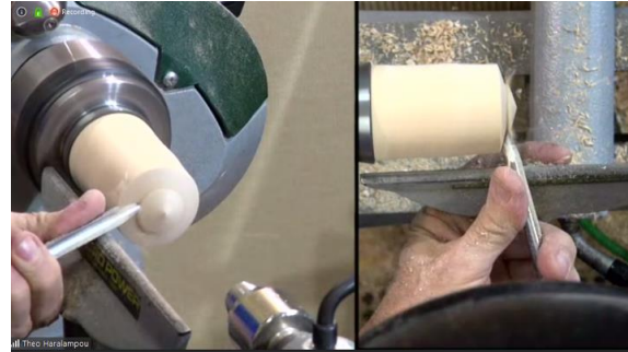
Figure 2 Creating the conical point

Theo proceeded to create a 10mm conical point. Figure 2 shows how to maintain greater control of the tool by pushing it into your thumb whilst placing your fingers under the tool rest.