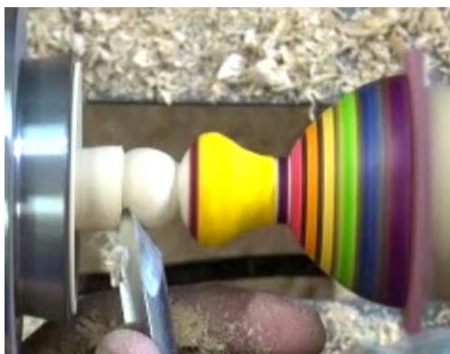
Figure 6 Turning the head of the ballerina

In Figure 6 you can see to complete the colouring of the ballerina a black marker was applied between each colour to add further highlight.