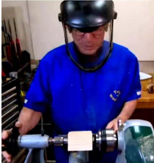
Figure 1 Jacaranda piece 70mmx90mm

(Editor's Note: This demonstration took place in May 2020)