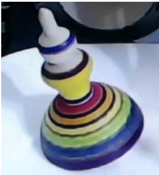
Figure 9 The Rainbow Ballerina

We are grateful to Theo for sharing with other WSQ members his expertise, experience, practical tips and wonderful sense of humour.