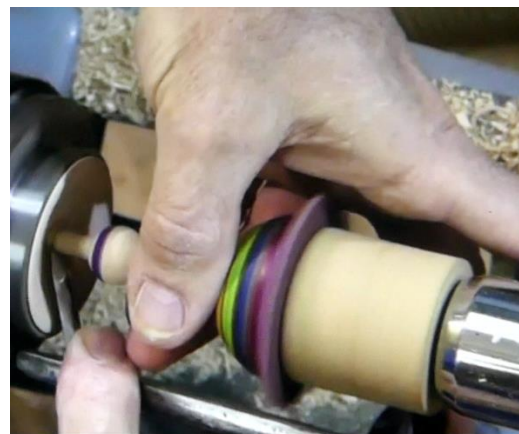
Figure 8 Securing the piece before final parting

Theo then skilfully parted the piece by gently caressing the bevel of the fingernail gouge against the spigot. He rested the tool along the length of his lower arm to his elbow whilst pushing the gouge against his thumb on the tool rest to control its movement.