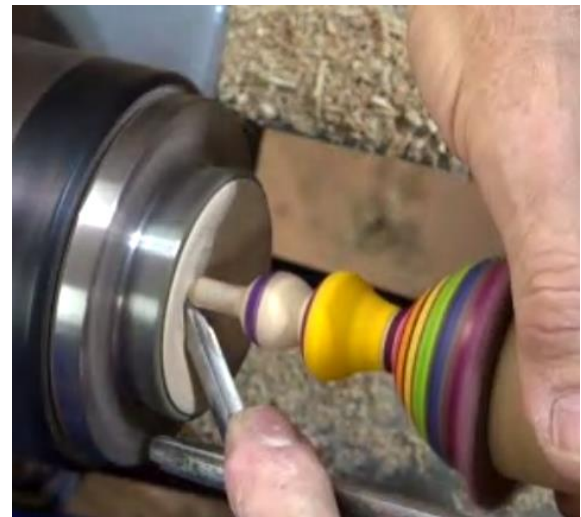
Figure 7 Fine undercutting to get the final length of the spindle

Then the 10mm spindle gouge was used to make the spindle end about 10mm long.