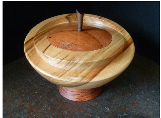
The Finished Bowl in a Bowl