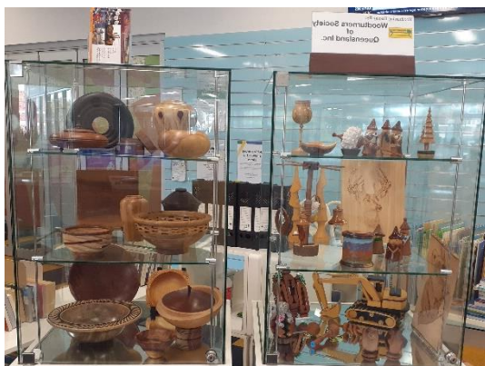
Wynnum Library Display