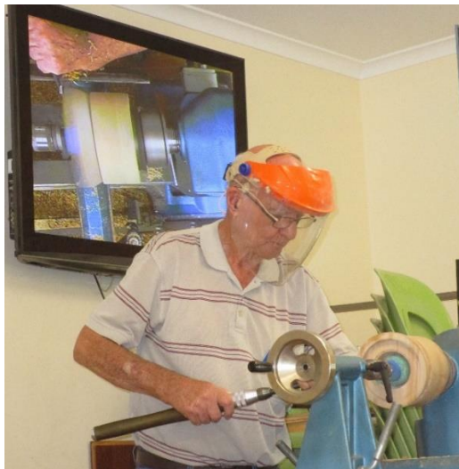
Removing a Section of the Outer Rim

area to be removed with a pencil. Next, he used a bowl gouge, making push cuts, to remove the section identified for removal. He sanded the top of the bowl.